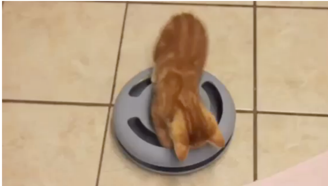
A Kitten at Play

They love to chase the red dot from a laser pointer, but never point it at their eyes. Cats also like straws, catnip